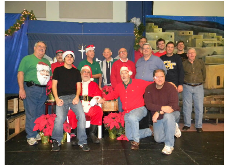
The crew had a great time at Breakfast With Santa 2010! Join us on December 10th for this year's event.

Perhaps you know what it's like to lose hope. Zechariah's story reminds us that God's plans cannot be hampered, even when the laws of nature stand in the way. Hold on to your hope because God works miracles.